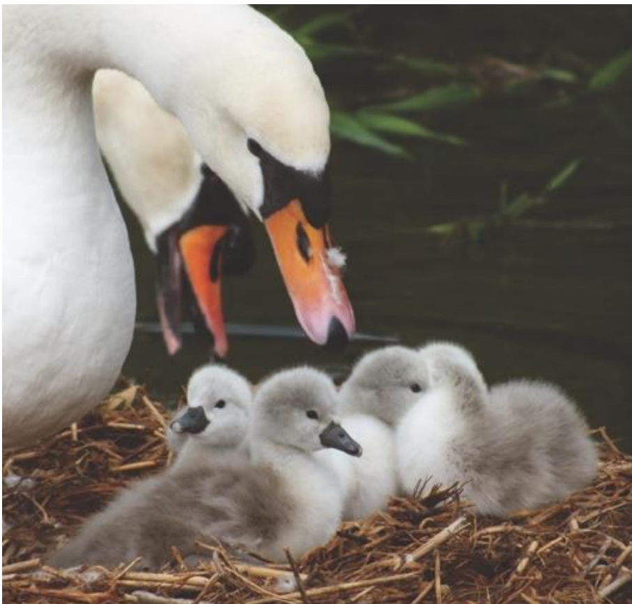
A sample photo from their 2020 calendar